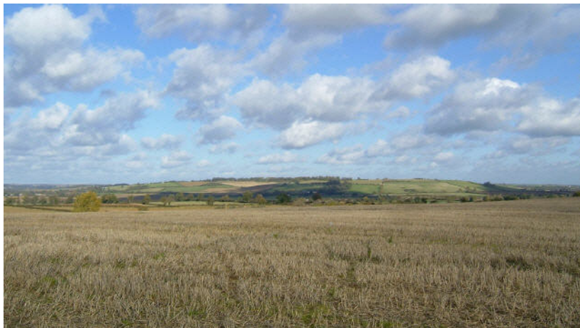
Stoke Albany (north of the A407 road between Market Harborough and Corby)