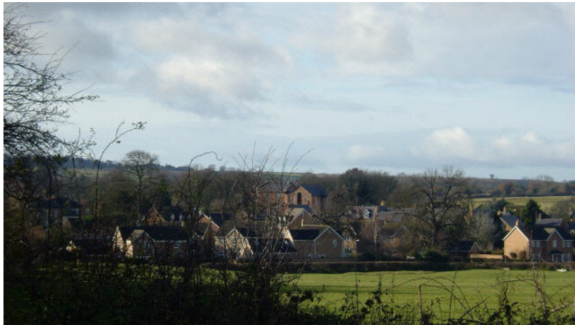
Milton Malsor Site (Milton Malsor Parish)